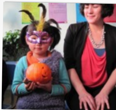
LIGAYA AND STUDENT